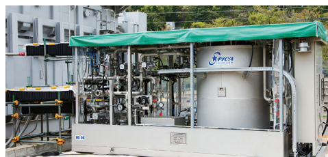
Kanden Engineering Corp.

For example, Kanden Engineering Corp. has developed a technology for harmlessly processing power transformers that contain small quantities of PCBs. In October 2014, we began on-site cleaning of transformers that were contaminated with PCBs and difficult to move because of their large size. Now, in addition to doing this within the group, we are also expanding this business throughout Japan.