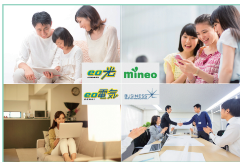
K-Opticom Corporation service brands

We offer a range of attractive services such as the “eo Hikari” FTTH service and the “mineo” mobile phone service. In addition, we began participating in the electric power business and started providing the “eo Denki” service in April 2016. We continue to offer new services and value through collaborations with other companies and industries in order to meet consumer needs.