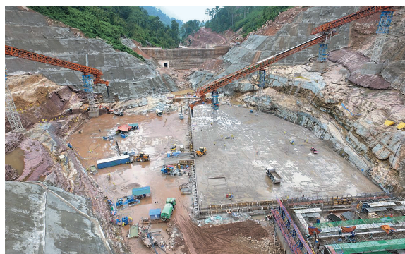
Dam construction site