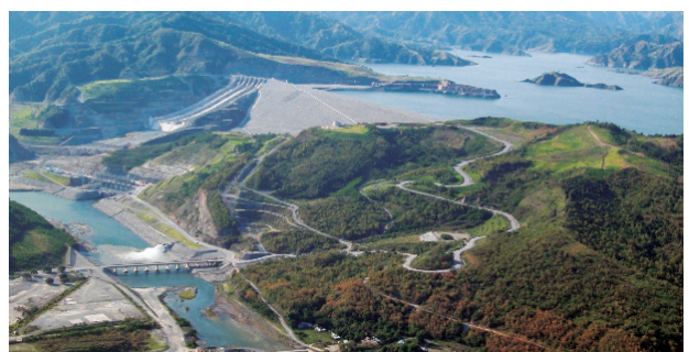
View of the San Roque Hydropower Station in the Republic of the Philippines

When doing these overseas activities, we aim to make the projects and consulting more valuable by introducing highly efficient equipment and implementing maintenance in such a way KEPCO have done in Japan, while contributing to improving the power infrastructures of our partner countries and mitigating impact on the global environment.