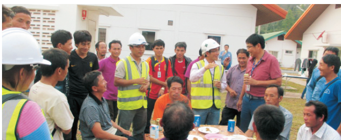
Interaction with residents of a village that will be moved

We have abundant experience and expertise in hydroelectric power generation, most notably from the Kurobegawa No. 4 Power Station which is often called Kuroyon. Utilizing these, we are acting as a project leader in the development of a hydropower project in Laos. The main dam of Nam Ngiep 1 is on a large scale equivalent to Kurobe Dam but with about 10 times the water retention capacity. Along with constructing the dam, since it is necessary for some residents to move, we are also developing a new village for them so that they will be able to live even richer lives while maintaining their own unique cultures after the resettlement. We are also considering the labor conditions of the construction site and thoroughly endeavoring to preserve the natural environment of the watershed as we advance the construction of Nam Ngiep 1.