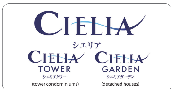
Kanden Realty & Development Co., Ltd.

In April 2016 the KANDEN FUDOSAN group companies and MID Urban Development group companies were merged to form Kanden Realty & Development group. The new group will expand business in the Tokyo metropolitan area and pursue a well-balanced portfolio of lot selling, leasing, and fee businesses (real estate brokerage and operations management), to meet a range of needs in real estate as a comprehensive real estate group.