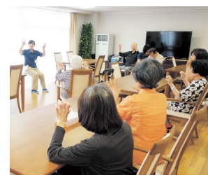
Kanden Joy Life Co., Ltd. Private nursing home with caregiving Yutorem Minoh Sakuragaoka