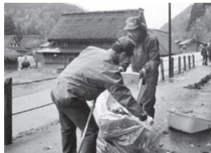
▲ Cleanup at Suganuma Gassho-zukuri village in Nanto-shi, Toyama prefecture