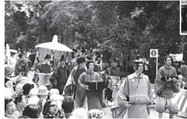
◀ Voluntary participation in the Aoi Festival parade