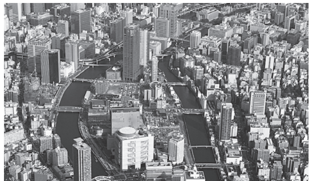
Overview of Nakanoshima

The Round Table on the Future of Nakanoshima was established in 2004 to examine prospects for further development and vitalization of Nakanoshima, with Kansai Electric Power serving as the organization's secretariat. The organization is currently promoting realization of the Nakanoshima urban renewal concept formulated in 2013 in collaboration with 30 enterprises (as of June 2014) and other entities with land rights in the district, as well as a range of other urban renewal activities such as holding study seminars and lectures on disaster preparedness.