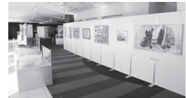
Exhibition of selected works (part of sponsorship activities for Persons with Disabilities Week)

Since 2001, Kansai Electric Power has been holding the Collabo Art 21, an exhibit that provides an opportunity for individuals with disabilities to display their works. Visitors can appreciate the art and sense the potential of the artists. Works selected for exhibiting can also be seen on our website.