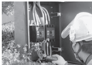
▲ Inspecting electrical equipment at a community center designated as a disaster refuge in Himeji-shi, Hyogo prefecture