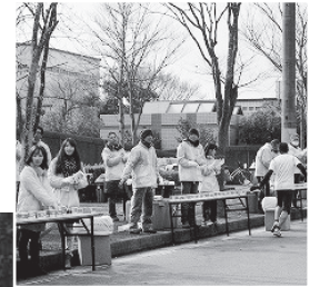
▲ Voluntary support for the Sanda International Masters Marathon

To contribute to regional development and vitalization, we are working to support traditional culture and regional events rooted in local communities in a variety of ways.