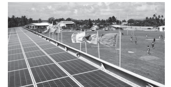
Solar power project in Tuvalu

In 2008, we also installed solar power generation equipment in Tuvalu, which is in danger of being submerged under water as a result of rising sea levels caused by global warming. For two years thereafter, we continued to monitor the equipment and provide operational support, and made efforts to transfer our technologies and know-how to our local partners. We are striving to promote the development of sustainable energies through such efforts. Since 2005, we have been holding workshops on renewable energies and energy conservation for electric power companies in the Pacific island nations. The 2012 workshops focused on the theme of improving the efficiency of energy use. We also held a technical workshop in Nepal in December 2012 on the topic of solar power generation. In these ways, the Kansai Electric Power Group is participating in various projects around the globe, training experts and transferring technologies, and helping to come up with solutions to global environmental problems.