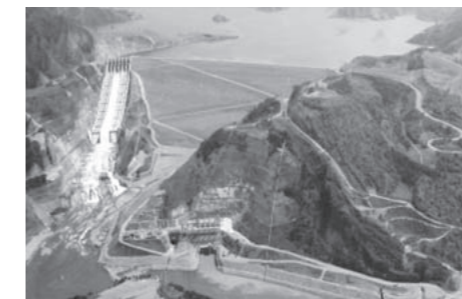
San Roque Hydropower Station (Philippines)

In the projects in which we are involved, our management support is supplemented with active technical support, as this is one of the Kansai Electric Power Group's strengths. Our employees are even now stationed on site at projects in Thailand, the Philippines, Singapore, and Australia, where they are involved in providing technical guidance on power generation equipment. Specifically, at the Senoko Power Station in Singapore, we dispatched engineers to participate in repowering work (completed in 2012) to increase the efficiency of existing power generation equipment, and we are working to improve the procedures and quality of work being done there, from process management onward. At the San Roque Hydropower Station in the Philippines, we conduct an annual technical training program for management supervisors and operations/maintenance personnel, aimed at future overhauls.