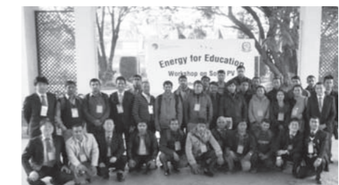
Technical workshop on solar power generation in Nepal