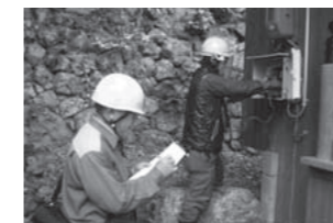
Electrical equipment inspection for Susa Shrine (Arita, Wakayama Prefecture)

We work with local fire departments to prevent fires at temples, shrines, and other cultural properties by inspecting electrical equipment. We search for short circuits and electrical wiring abnormalities and provide instructions to customers regarding the safe use of their electrical equipment. We also perform similar equipment checkups at the homes of elderly people who live alone, and at social welfare facilities.