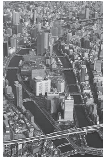
Overview of Nakanoshima

The Round Table on the Future of Nakanoshima was established in 2004 to examine prospects for further development and vitalization of Nakanoshima, with Kansai Electric Power serving as the organization's secretariat. The organization is currently promoting realization of the Nakanoshima urban renewal concept formulated in 2012 in collaboration with 29 enterprises (as of March 2013) and other entities with land rights in the district, as well as a range of other urban renewal activities such as holding study seminars and lectures on disaster preparedness.