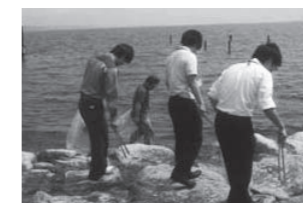
Lake Biwa coastal cleanup