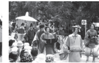
Participation in the Aoi festival parade