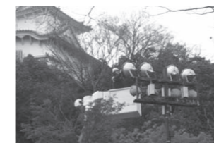
Himeji Castle lighting cleanup

In addition to our activities with local communities, we are carrying out cleanup activities around our business locations, at tourist sites, and along coasts and rivers, centering on Kansai Electric Power Group Environment Month (June) and Customer Appreciation Month (November).