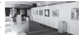
Exhibition of selected works (part of sponsorship activities for Persons with Disabilities Week)

Since 2001, Kansai Electric Power has been holding the Collabo Art 21, an exhibit that provides an opportunity for individuals with disabilities to display artworks for the appreciation of others. Each year the exhibit receives large numbers of entries, and to date over 10,000 works have been submitted. Works selected for exhibiting can also be seen on our website.