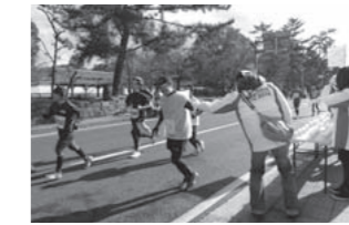
Voluntary support for the Nara Marathon

We are working to support traditional culture and regional events rooted in local communities in a variety of ways, to render service for regional development and vitalization. For example, employees at our Nara branch are participating in the Nara Marathon as volunteers.