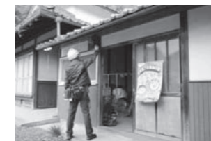
Electrical equipment inspection for housing for elderly persons