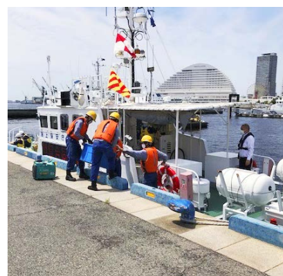
Marine transport drill with 5th Regional Coast Guard Headquarters