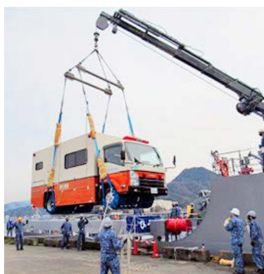
Marine transport drill with Japan Maritime Self-Defense Force Maizuru Regional Headquarters

Specifically, we proactively participated in disaster response drills and programs held by municipalities and designated public corporations; moreover, we conducted joint emergency drills with the Self-Defense Forces and the Japan Coast Guard according to a cooperative system to respond to disasters.