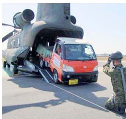
Helicopter transport drill with Japan Ground Self-Defense Force Middle Army