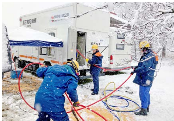
Emergency power transmission with a high-voltage generator vehicle