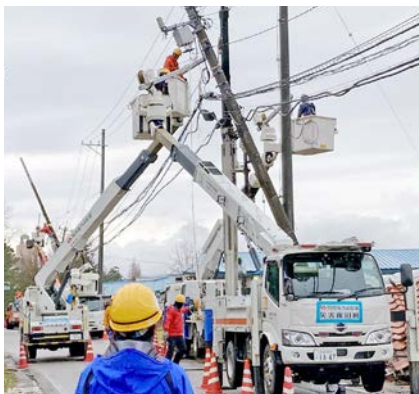
Power outage restoration work

Based on the inter-business disaster cooperation plan in disaster responses submitted to the Ministry of Economy, Trade and Industry, we will seek a stable power supply through quick recovery, when extensive damage is anticipated in the event of or before the occurrence of a disaster, by cooperating with general electricity transmission and distribution utilities and related organizations. In the Noto Peninsula Earthquake that occurred on January 1, 2024, a maximum of 40,000 households lost power in the service area of the Hokuriku Electric Power Transmission and Distribution Company. Following this, starting two days after the earthquake, a cumulative total of 727 recovery support staff and 125 vehicles were dispatched to the quake-hit area by the Kansai Electric Power Company, Kansai Transmission and Distribution, and subcontractors, based on the inter-business disaster cooperation plan. Going forward, based on this plan, we will implement joint emergency drills that involve general electricity transmission and distribution utilities, including Kansai Transmission and Distribution, Inc., as well as related organizations, aiming for enhanced cooperation to ensure a more resilient power supply. We will continue to strengthen our efforts for swift disaster recovery.