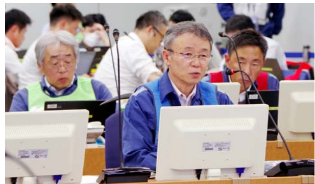
Group-wide comprehensive emergency response drills

In the event of a major disaster, all employees and their families will be notified of any information pertaining to the disaster at the same time. We also have established action standards so that we can build a response system promptly after a disaster occurs, even on holidays or during the night.