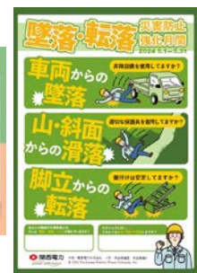
Posters encouraging "Think safety and act safely"