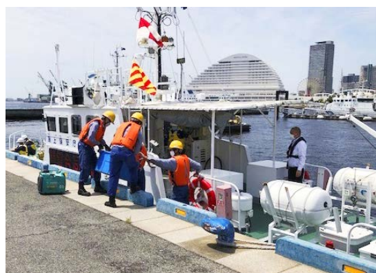
Marine transport drill with 5th Regional Coast Guard Headquarters