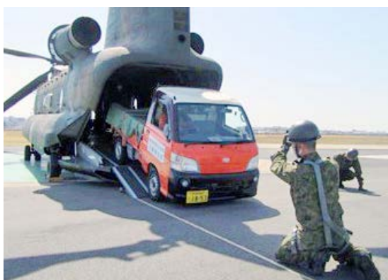
Helicopter transport drill with Japan Ground Self-Defense Force Middle Army