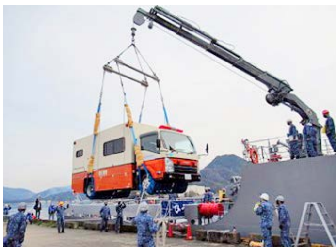
Marine transport drill with Japan Maritime Self-Defense Force Maizuru Regional Headquarters

Specifically, we proactively participated in disaster response training sessions and programs held by municipalities and designated public corporations; moreover, we conducted joint training with the Self-Defense Forces and the Japan Coast Guard according to a cooperative system to respond to disasters.