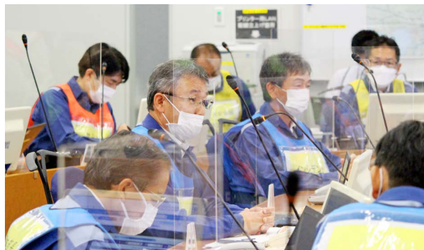
Group-wide comprehensive emergency response drills

In the event of a major disaster, employees will be notified of any information pertaining to the disaster at the same time. We also have established action standards so that we can build a response system promptly after a disaster occurs, even on holidays or during the night.