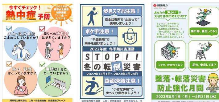
Posters encouraging "Think safety and act safely"

Focusing on the frequent occurrence of underfoot accidents, this campaign is implemented in May, when the number of construction operations increases, to prevent accidents from occurring.