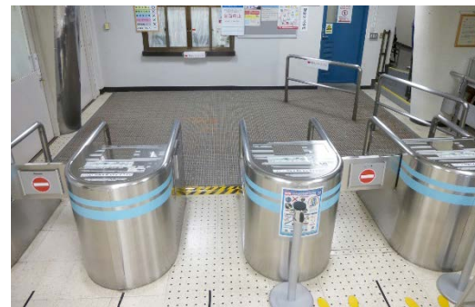
Seed-removal floor mat

Kurobe Dam, which is situated in a national park, receives one million visitors annually. At Ogizawa Station, which is the entrance to the Nagano Prefecture side, the seeds of plants that do not naturally grow in Kurobe sometimes get brought over on the soles of the shoes of tourists. Thus, we have placed seed removal mats at the station ticket gates to prevent the influx of non-native species. The removed seeds are collected with a vacuum cleaner and incinerated.