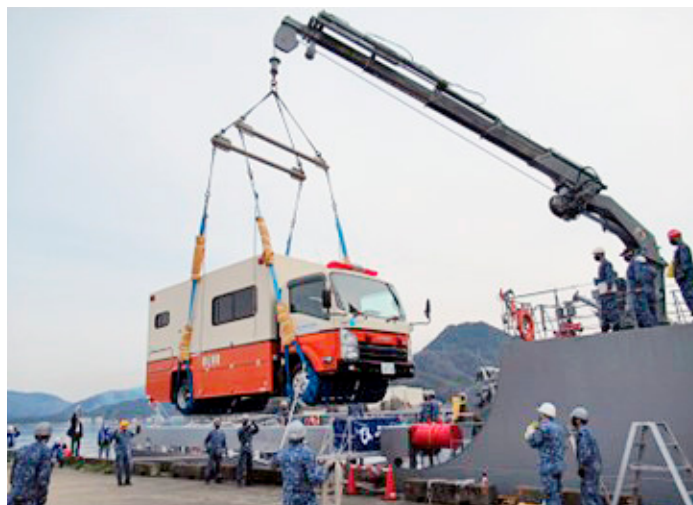
Marine transport drill with Japan Maritime Self-Defense Force Maizuru Regional Headquarters in March 2021

Specifically, we proactively participated in disaster response training sessions and programs held by municipalities and designated public corporations; moreover, we conducted joint training with the Self-Defense Forces and the Japan Coast Guard according to a cooperative system to respond to disasters.