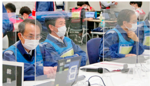
Group-wide comprehensive emergency response drills

Moreover, with the President of the Kansai Electric Power Co., Inc. serving as Chief of the Emergency Headquarters, group-wide comprehensive emergency response drills are conducted every year and these drills see full collaboration between the Kansai Electric Power Co., Inc. and Kansai Transmission and Distribution, Inc. We are committed to improving our disaster response skills and raising disaster awareness, not only to prepare for the occurrence of the Nankai Trough Earthquake but also with consideration for severe accidents such as the simultaneous occurrence of a nuclear power disaster or during occasions when the balance of power supply and demand is tight. In the event of a major disaster, employees will be notified of any information pertaining to the disaster at the same time. We also have established action standards so that we can build a response system promptly after a disaster occurs, even on holidays or during the night.