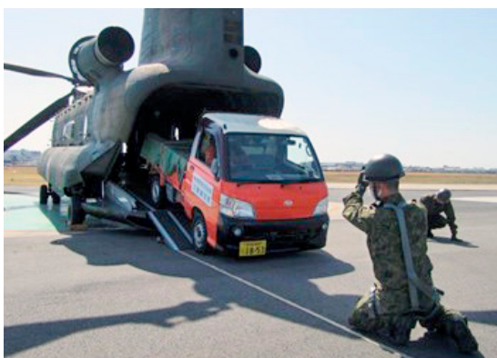
Helicopter transport drill with Japan Ground Self-Defense Force Middle Army in March 2021