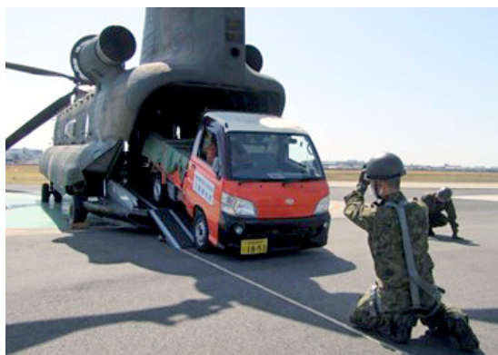
Helicopter transport drill with Japan Ground Self-Defense Force Middle Army in March 2021