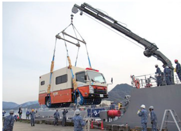
Marine transport drill with Japan Maritime Self-Defense Force Maizuru Regional Headquarters in March 2021

Specifically, we proactively participated in disaster response training sessions and programs held by municipalities and designated public corporations; moreover, we conducted joint training with the Self-Defense Forces and the Japan Coast Guard according to a cooperative system to respond to disasters.