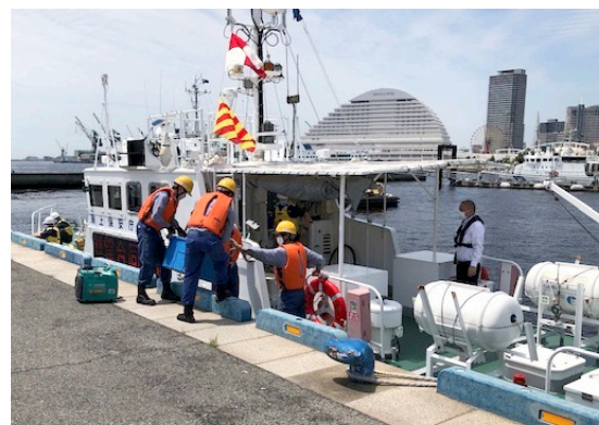
Marine transport drill with 5th Regional Coast Guard Headquarters in June 2021