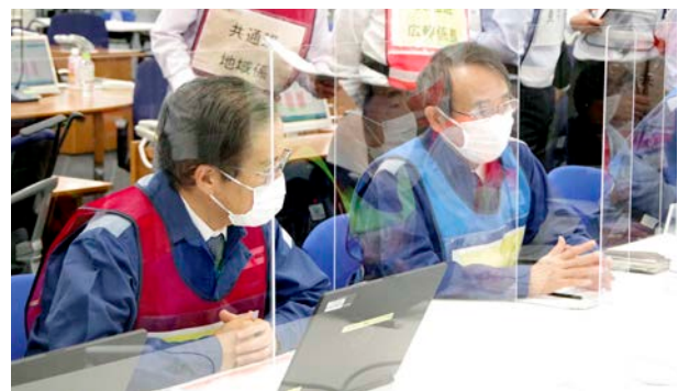
Group-wide comprehensive emergency response drills

In the event of a major disaster, employees will be notified of any information pertaining to the disaster at the same time. We also have established action standards so that we can build a response system promptly after a disaster occurs, even on holidays or during the night.