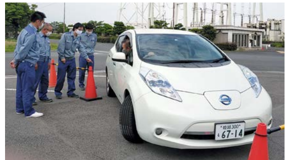
Thoroughly managing safe driving

For employees who drive cars, we have instituted our own Vehicle Operator Certification System, aiming for a safe driving level that is one step higher. After receiving education related to safe driving and practical training, they are given the vehicle operator certificate. We work to implement thorough and safe driving management by providing them with education and training periodically.