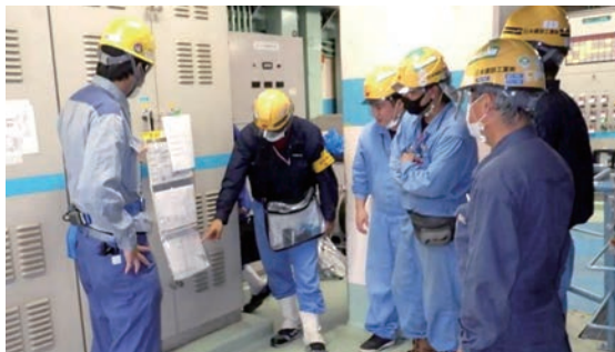
Bilateral communication with subcontractors and others

When the opportunity presents itself, our employees visit equipment construction/maintenance sites and are active in creating and enhancing opportunities to communicate with subcontractors, etc. so that we can deepen mutual understanding and promote safety activities together. By proactively facilitating bilateral communication, we are striving to raise safety awareness and reduce the risk of accidents.