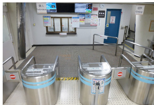
Seed-removal floor mat

Kurobe Dam, which is situated in a national park, receives one million visitors annually. At Ogizawa Station, which is the entrance to the Nagano Prefecture side, the seeds of plants that do not naturally grow in Kurobe sometimes get brought over on the soles of the shoes of tourists. Thus, we have placed seed removal mats at the station ticket gates to prevent the influx of non-native species. The removal seeds are collected with a vacuum cleaner and incinerated.