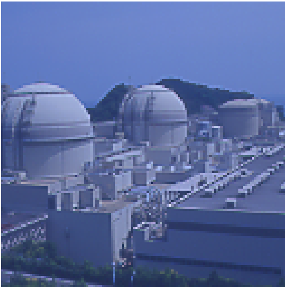
Ohi Nuclear Power Plant (4,710 MW)