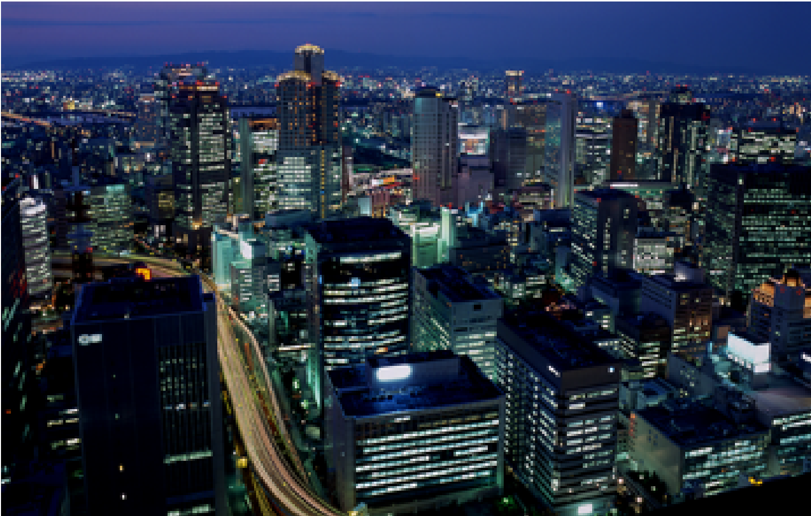
Osaka Nakanoshima Area

The Kansai Electric Power Co., Inc. (Kansai EP) has been serving the power needs of the Kansai area since its establishment in 1951. Through more than half a century it has developed and operated its own power stations, secured the diversified resources indispensable to running them, and delivered the generated power with optimum efficiency and reliability to customers throughout the region. Geographically, Kansai EP's service area is remarkably expansive, covering nearly 29,000 km 2 . The Company's output is equally impressive: in the fiscal year ended March 31, 2006, sales reached 147.1 billion kWh — almost equal to the national power needs of Sweden. In response to the Kansai region's power demands, Kansai EP works steadfastly at technological development. Today, in an era of rapid deregulation of public utilities, the Company is reinforcing its position in core electricity operations while simultaneously striving to implement management reforms that will enable Kansai EP to achieve new growth to take it solidly into the future.