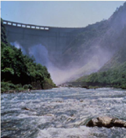
Kurobegawa No.4 Hydro Power Plant (335 MW)

Cautionary Information with Respect to Forward-Looking Statements Statements made in this Annual Report with respect to The Kansai Electric Power Company's plans, strategies and beliefs, and other statements that are not historical facts are forward-looking statements about the future performance of the Company. These statements are based on management's assumptions and beliefs in light of the information currently available to it, and therefore involve risks and uncertainties. Potential risks and uncertainties include, without limitation, the general economic conditions and changes to laws and regulations.