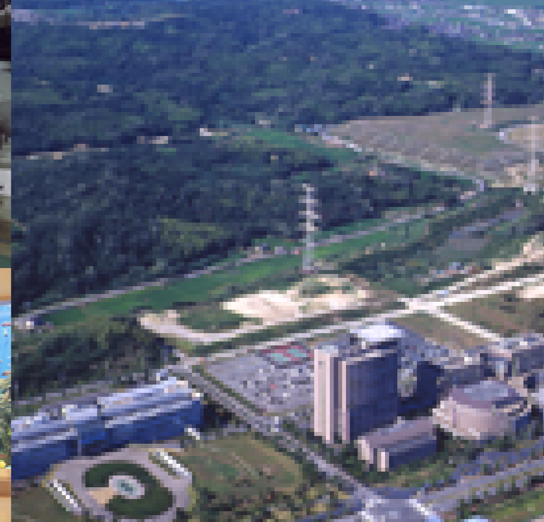
Kansai Science City

Kansai EP provides invaluable support to projects and initiatives transforming Kansai into an ever more vibrant and people-friendly region.