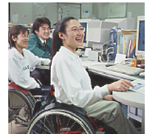
Kanden L-Heart, a Kansai EP subsidiary

In these various ways, through national projects, nurturing of new industries and a colorful palette of undertakings in support of the evolving needs of local citizens, Kansai EP today is contributing on broad fronts to the ongoing development of its home region.