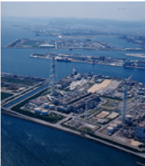
Himeji No.1 Thermal Power Plant (1,442 MW)