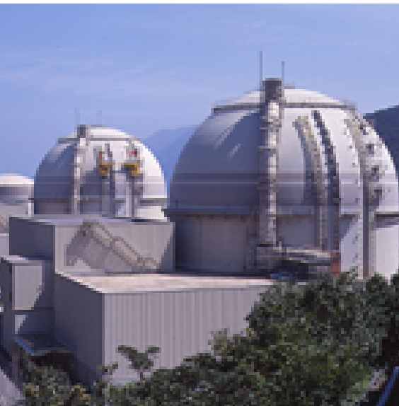
Ohi Nuclear Power Plant (4,710 MW)