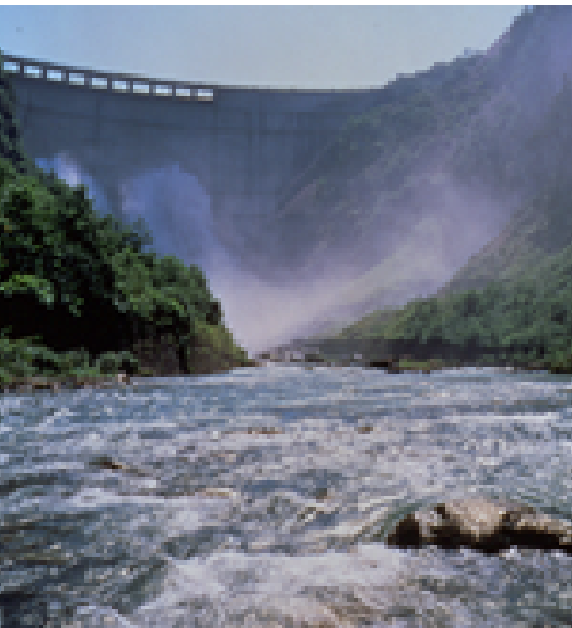
Kurobegawa No.4 Hydro Power Plant (335 MW)

While currently the nation is in a severe and persistent economic recession, the Kansai region is concentrating its full roster of resources — its vigor, vitality and wisdom — to ensure the area's sustained and dynamic growth in the first century of this new millennium.