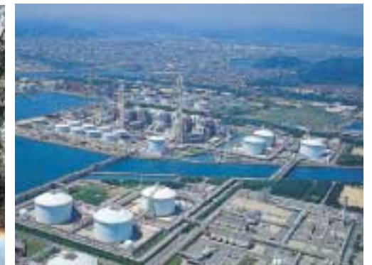
Himeji No.2 Fossil Fuel Power Plant and Himeji LNG Terminal.

Cautionary Information With Respect to Forward-Looking Statements Statements made in this annual report with respect to The Kansai Electric Power's plans, strategies and beliefs, and other statements that are not historical facts are forward-looking statements about the future performance of the company. These statements are based on management's assumptions and beliefs in light of the information currently available to it, and therefore involve risks and uncertainties. Potential risks and uncertainties include, without limitation, the general economic conditions and changes to laws and regulations.