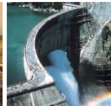
Kurobegawa No.4 Hydro Power Plant.