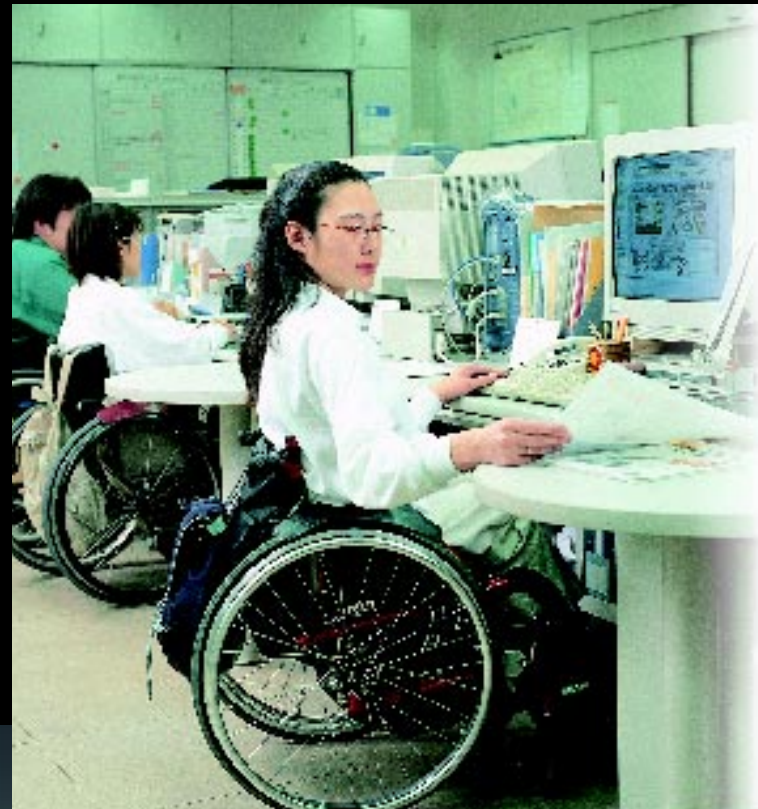
Kanden L-Heart, a Kansai EP subsidiary