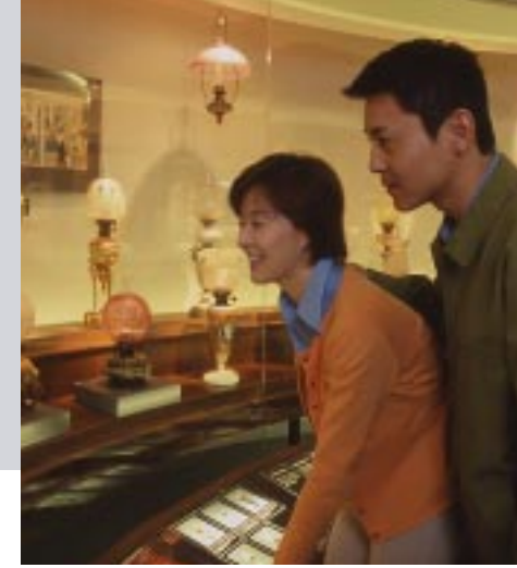
Kobe Lamp Museum